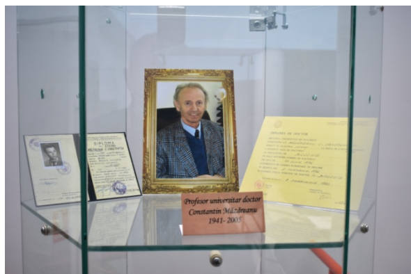
Fig. 2 - His portrait and diplomas of studies