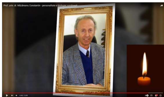
Fig. 6 - Screen capture – digital material

Besides this information presented on physical support, we also prepared various multimedia materials made available on the Internet addresses of the Museum ( Fig. 6 ).