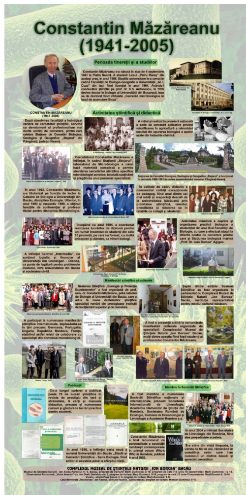
Fig. 5 - Roll-up presenting the Professor's life and work